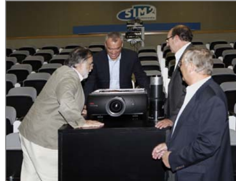
Intrigued by the innovative solutions adopted in SIM2 products, Mr. Coppola requested to take a good look "under the hood".

In the Fall of 2008, SIM2 invited Mr. Coppola to experience first hand the "SIM2 way" of doing things. During the tour of the manufacturing plant in Pordenone, Italy, he received a demonstration of the processes from concept to the finish product. That is when Mr. Coppola took the "European delivery" of his own SIM2 projector. From there a working partnership has evolved with Mr. Coppola and his brilliant team of technical engineers. The collaborative efforts have helped SIM2 in developing solutions that bring together the technologies needed by Hollywood Producers. We are enthusiastic about the relationship that has developed overtime between SIM2 and Francis Ford Coppola; it is one of reciprocal trust and admiration.